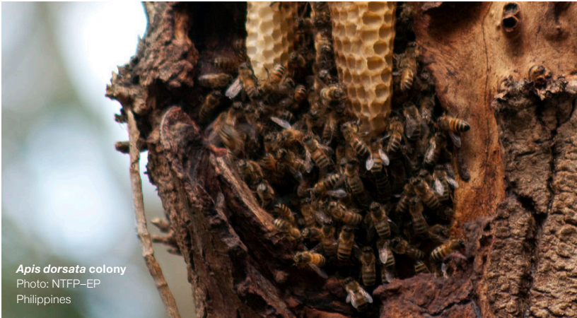
Apis dorsata colony

Understanding the social structure of bees and the architecture of their hives is very important in establishing protocols for sustainable harvest of wild honey. Honeybees produce honey by collecting nectar, pollen, and dew from plants. They bring back the honey to their hive to store as food to keep them nourished when they are unable to forage outside. Stored honey also feeds their brood in the hive, making honey harvesting a potentially disastrous activity for future generations of bees if not managed properly.