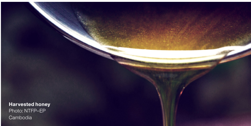
Harvested honey